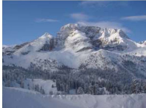
Hotel « Hohe Gaisl » with Mount Gaisl