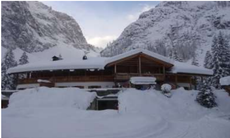
Restaurant « Talschlusshütte » in heart of the Dolomites

You will go cross country skiing on the sunny side with the best panorama today. A short transfer will take you above the edge of the woods and the Dolomites of Sexten/Sesto are close. Nemes hut - Coltrondo hut – Kreuzbergpass/Passo Monte Croce are inviting to drink or eat something along the route.